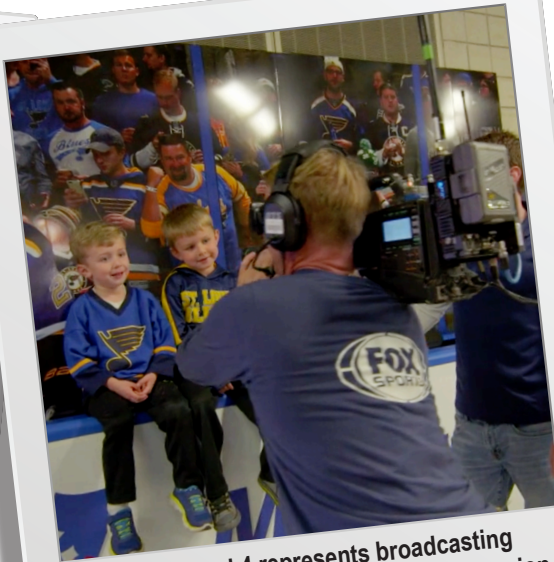
IBEW Local 4 represents broadcasting professionals throughout the St. Louis region, including camera operators, news videographers and assignment editors.